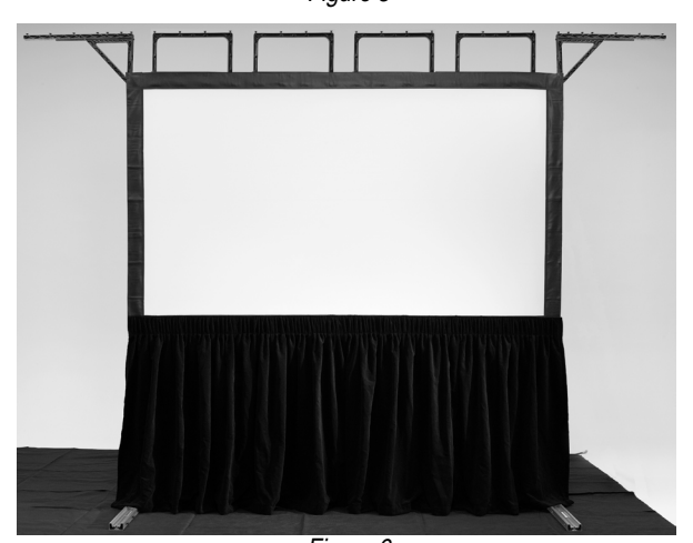
Figure 6 (Side Drapes and Valance removed for a clear view of the locations of Valance Bars and Drapery Bars)